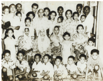
c. 1956

1 Empress Place, Singapore 179555 acm.org.sg