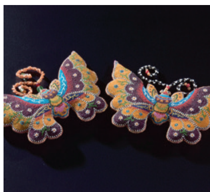
Bed ornaments Penang, early 20th century Cotton, beads, metal thread

93 Stamford Road, Singapore 178897 nationalmuseum.sg