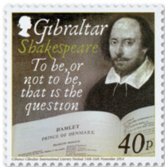
Shakespeare 450th Anniversary Gibraltar, 2014