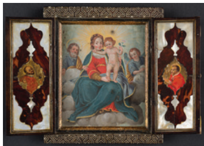
Portable shrine Turkey, shrine: 16th or 17th century Painting: 18th century