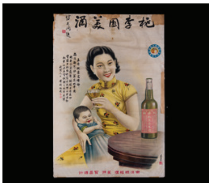
Poster with Fu Wu Men's calligraphy