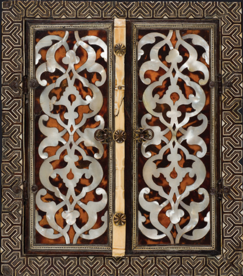
SHRINE: TURKEY, 16TH OR 17TH CENTURY PAINTING (INSIDE): 18TH CENTURY ASIAN CIVILISATIONS MUSEUM

GUIDE TO HERITAGE HAPPENINGS AND MUSEUMS IN SINGAPORE